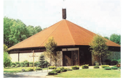
St. Margaret Church 845 Third Street Woodbury Heights, NJ 08097

E-Mail: TheInfantJesusParish@comcast.net