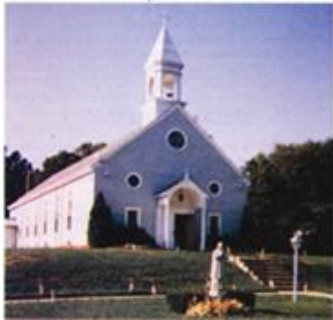
St. John Vianney Church 2901 Good Intent Road Deptford, NJ 08096