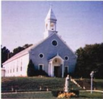
St. John Vianney Church 2901 Good Intent Road Deptford, NJ 08096