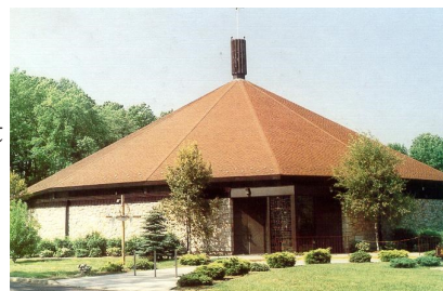
St. Margaret Church 845 Third Street Woodbury Heights, NJ 08097

Web Site: www.TheInfantJesusParish.org E-Mail: TheInfantJesusParish@comcast.net FAX: 856-384-8123