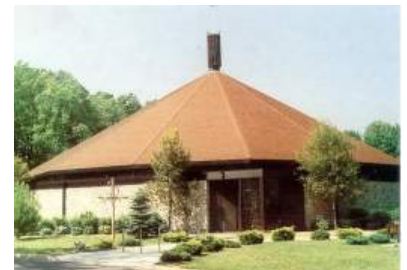
St. Margaret Church 845 Third Street Woodbury Heights, NJ 08097

Web Site: www.TheInfantJesusParish.org School Web Site: www.stmargarets-rs.org E-Mail: TheInfantJesusParish@comcast.net FAX: 856-384-8123