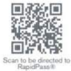
Scan to be directed to RapidPass®!

Donors needed! Come give blood in August for $20 Amazon.com Gift Card by email. See rcblood.org/Help