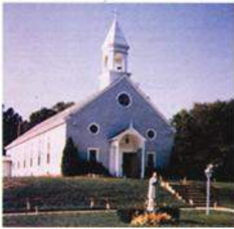
St. John Vianney Church 2901 Good Intent Road Deptford, NJ 08096