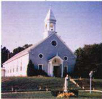
St. John Vianney Church 2901 Good Intent Road Deptford, NJ 08096