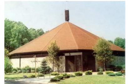
St. Margaret Church 845 Third Street Woodbury Heights, NJ 08097

Web Site: www.TheInfantJesusParish.org School Web Site: www.stmargarets-rs.org E-Mail: TheInfantJesusParish@comcast.net FAX: 856-384-8123