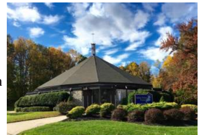
St. Margaret Church 845 Third Street Woodbury Heights, NJ 08097

Web Site: www.TheInfantJesusParish.org School Web Site: www.stmargarets-rs.org E-Mail: TheInfantJesusParish@comcast.net FAX: 856-384-8123