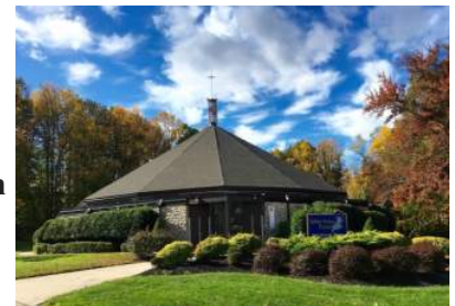
St. Margaret Church 845 Third Street Woodbury Heights, NJ 08097

Web Site: www.TheInfantJesusParish.org School Web Site: www.stmargarets-rs.org E-Mail: TheInfantJesusParish@comcast.net FAX: 856-384-8123