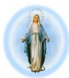
Legion of Mary